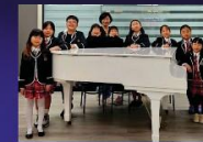
K Children's Choir